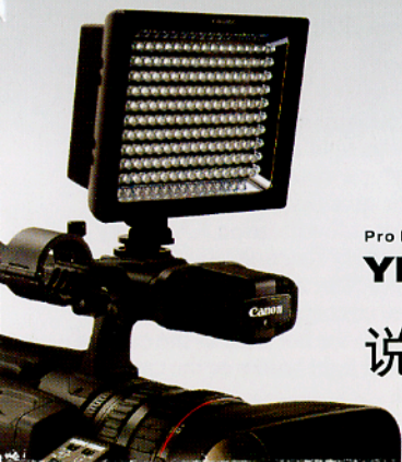
Pro LED Video Light YN 160S