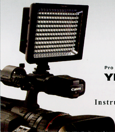
Pro LED Video Light YN 160S